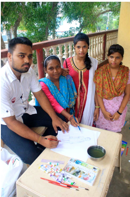
Art teacher with the girls.